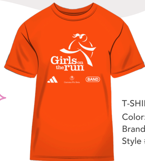
GIRLS ON THE RUN

T-SHIRT INFO Color: Orange Brand: M&O Style #: 4800