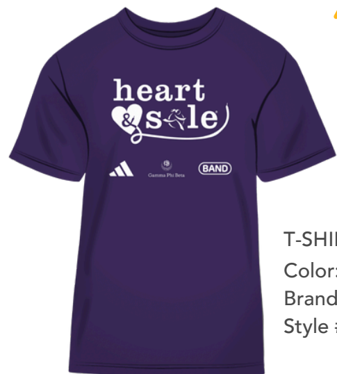
HEART & SOLE

T-SHIRT INFO Color: Purple Brand: M&O Style #: 4800