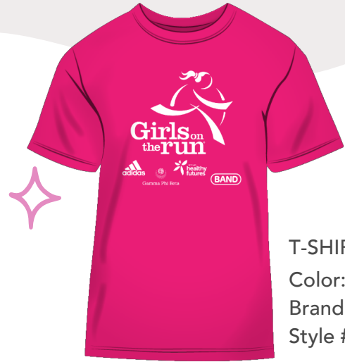
GIRLS ON THE RUN

T-SHIRT INFO Color: Heliconia Brand: Gildan Style #: 5000