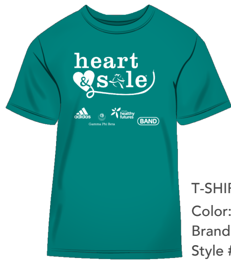
HEART & SOLE

T-SHIRT INFO Color: Heliconia Brand: Gildan Style #: 5000