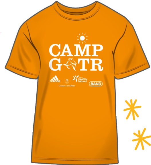
GIRLS ON THE RUN CAMP SHIRT

T-SHIRT INFO Color: Tennessee Orange Brand: Gildan Style #: 5000